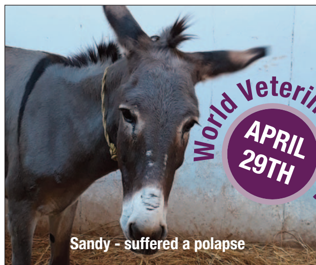
Sandy - suffered a prolapse

Laminitis is extremely painful and affects the tissues in the hoof. Prince is out in our paddocks where the sandy surface will help support his hooves, reduce his pain and limit the movement of the pedal bone in the hoof structure. Plenty of rest will assist in his recovery.