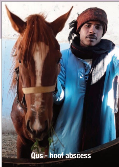
Qus - hoof abscess

With this straw our inpatients can lay down and snooze in comfort and some of them like to nibble on it too.